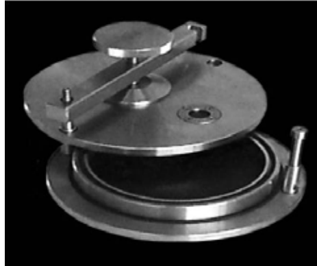
Migration cell for Single sided contact migration tests

The project will consider the substitution of a percentage of virgin material by recycled material (paper or plastic) in the selected structures in order to develop more environmentally friendly food packaging structures. As the main requirement for food packages is to always guarantee food safety for consumers, this substitution will be achieved by evaluating the functional barriers positioned between recycled layers and foodstuffs.