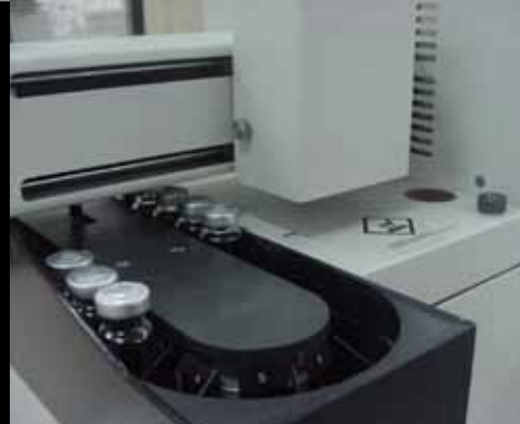
Head-space sampler for specific migration tests