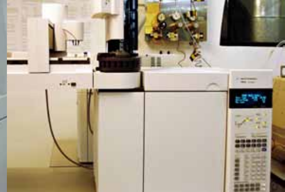
Chromatograph with flame ionization detector (GC-FID) for specific migration tests